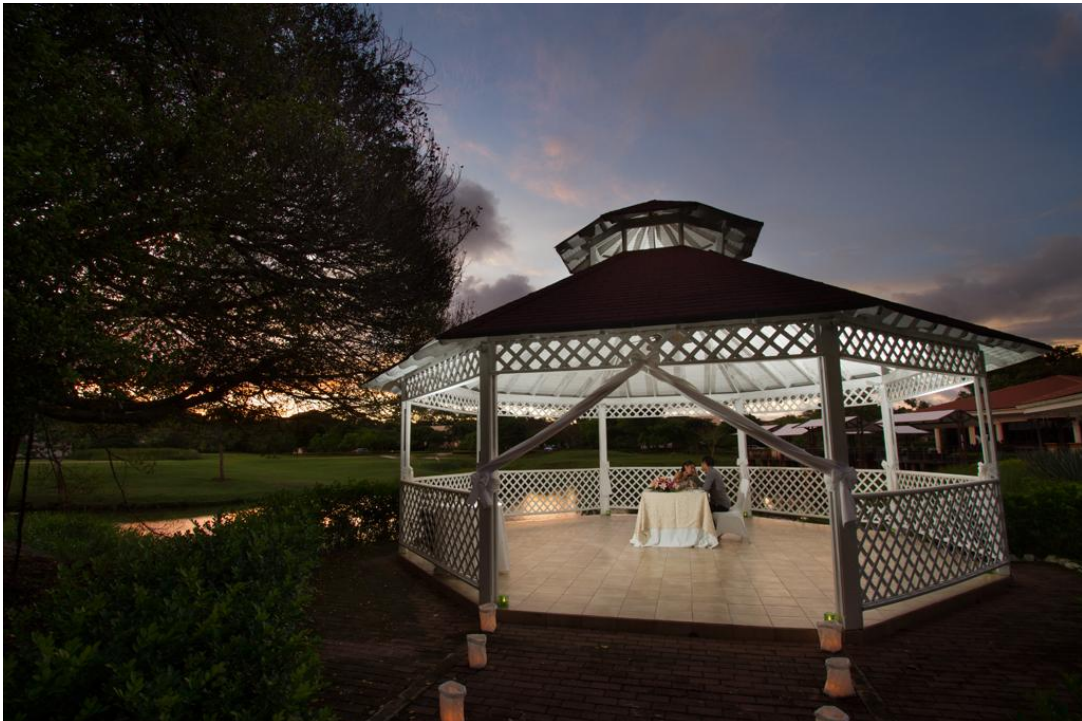
Gazebo: Ideal to enjoy sunset lights. View of the lake and mountain.