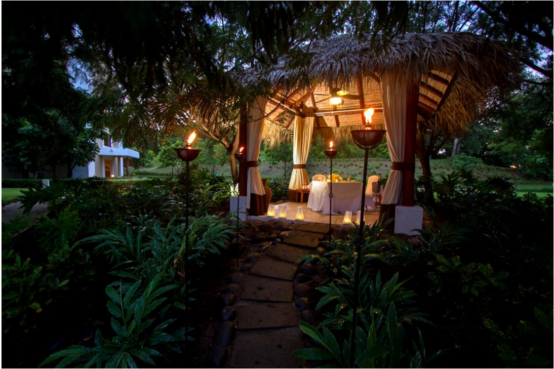
Palapa: Surrounded by lush vegetation and jungle-style. Pool view.

THE WESTIN GOLF RESORT & SPA PLAYA CONCHAL